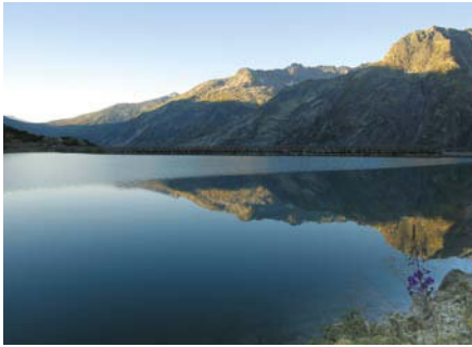
Gelmersee reservoir also feeds «Handeck 1» power plant

of the large housing (outside dimensions 2500 x 2000 x 2300 mm) were machined and provided with a new sealing groove.