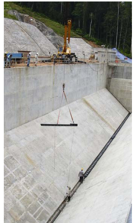
Construction of an open desander