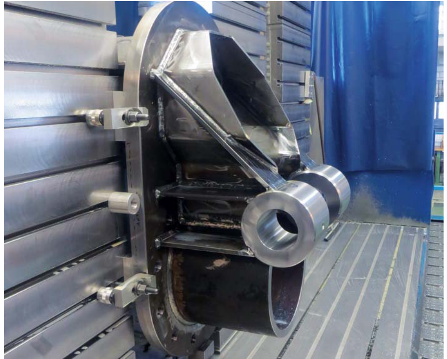
Finish-machined regulating support

The Tibram Group produced a new regulating support for the KWO power plant «Handeck 1». Based on the customer’s drawings, the complete support was manufactured in our works. For this, our production specialists had to establish all welding and machining sequences to the finest detail in order to meet the exacting demands on dimensional and shape accuracy. A particular challenge was compliance with the close geometric tolerances between the flange faces and bearing point. Thanks to vast experience and the meticulous planning of each step, the regulating support was completed to the entire satisfaction of KWO, and punctually delivered.