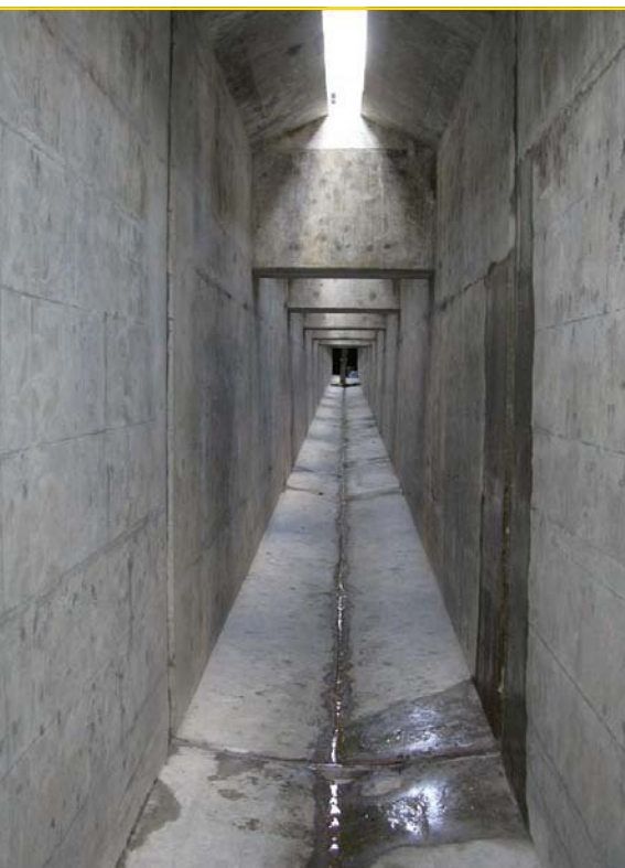
View into the flushing water channel

resistant and water spill leakage is fundamentally less. The well-proven slide guide plates, interference angles and cross-sectional geometry were retained. The overhaul also includes replacement of the press cylinders and parts of the hydraulic piping. For this project the Tibram Group supplied 18 brand new hydraulic cylinders with a stroke of 230 millimetres. They operate at a pressure of 230 bar, corresponding to an impact force of 40 tons. The cylinder and piston rods were coated with a special anti-corrosion agent before works assembly and successful testing at 330 bar. Our quality assurance program based on the ISO 9001 standard qualifies the Tibram Group to fulfil the required