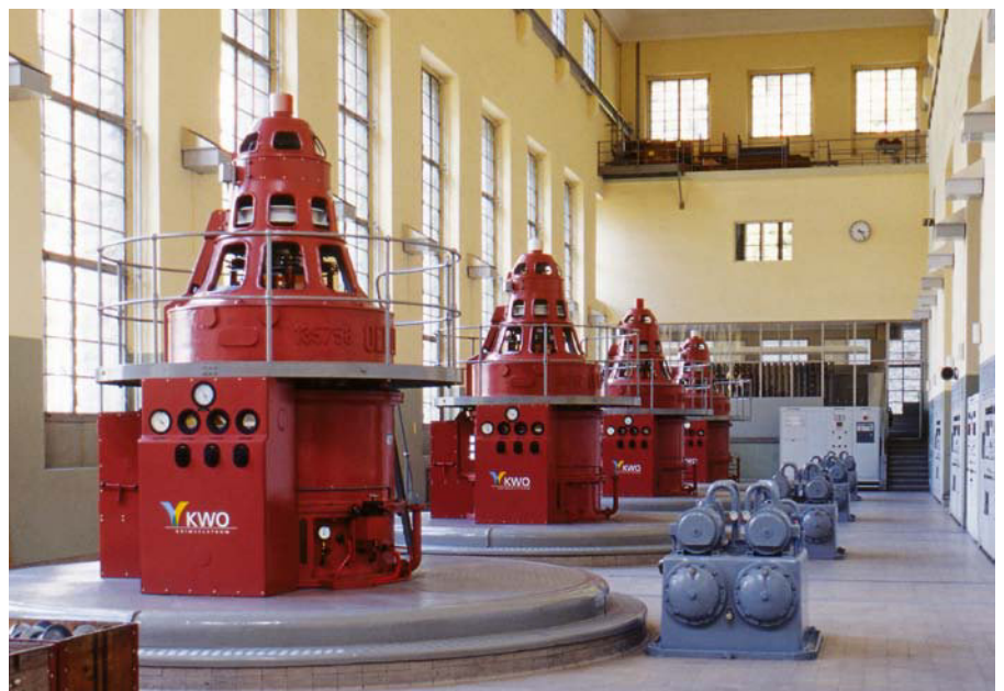
View into the machine room of «Handeck 1» power plant

On behalf of Grimsel Hydro, the Tibram Group overhauled the Linth-Limmern «Tierfehd» power plant turbine housing. Thanks to our large rigid-bed milling machine, this 3200 kg housing was easily reworked – also because the workshop is designed for handling large components. The two flange faces