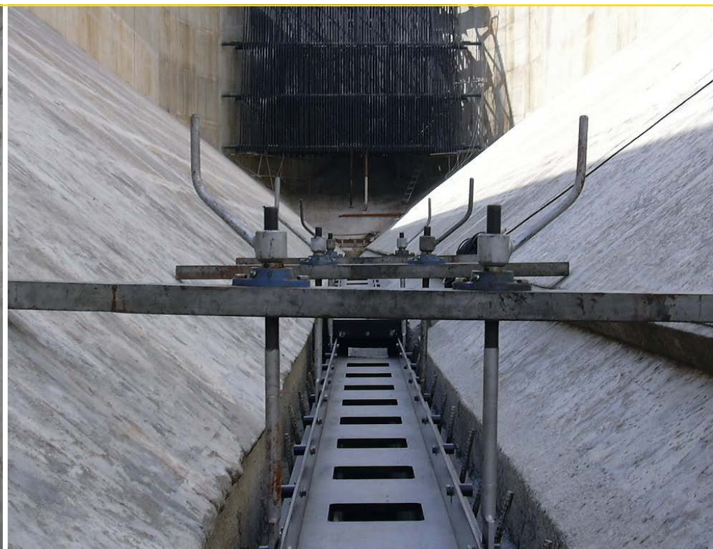
Aligning the baseframe