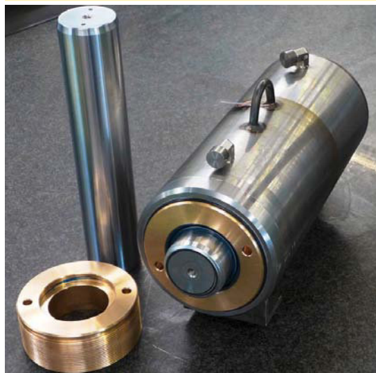
Assembled servo cylinder for a desanding system